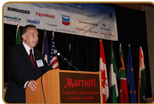
Peter Kent, Canadian minister of state for foreign affairs, delivers remarks at G20 Business Leaders Conference.

The organizations reaffirmed their collective commitment to the need to abide by existing international agreements and to be respectful of the social and environmental requirements of Africa. The conference called on G20 and African governments to target their efforts at improving the business environment by reducing trade barriers, upgrading transport and energy infrastructure, enhancing value chains, strengthening capital markets, and increasing local participation. Going forward, the group will meet on a regular basis to follow up on the meetings held in Washington, D.C., in September 2009 and in Toronto to measure progress.